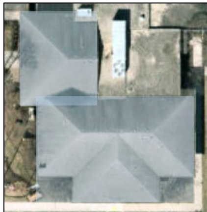
South & West Portion Administrative Offices & Police Department